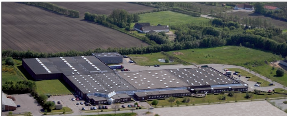
DALI headquarters, Denmark

With a reputation for quality, reliability and integrity, DALI offers an exciting range to suit every taste from the ultimate performance speakers to the cost-conscious series.